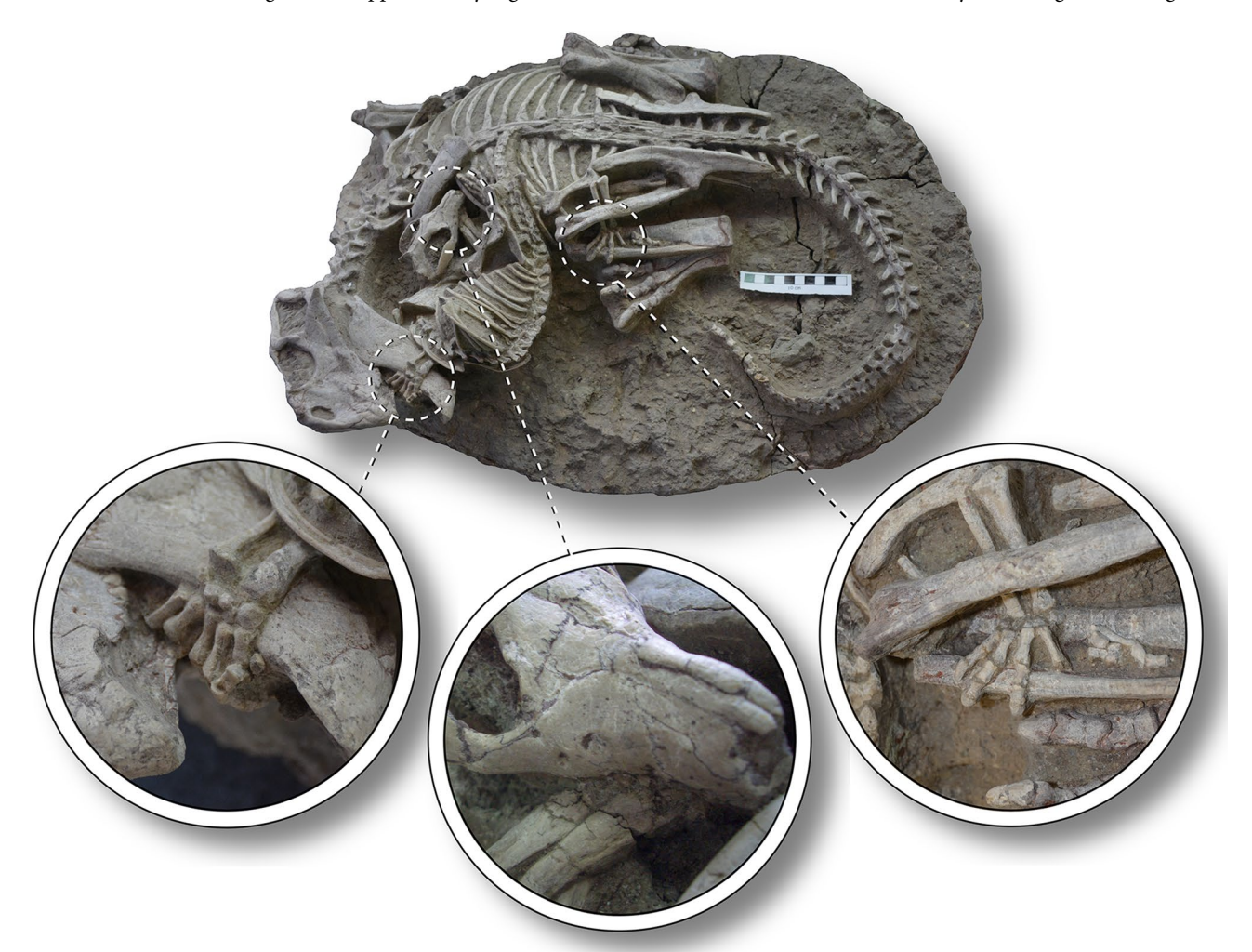
Figure 1. Psittacosaurus lujiatunensis-Repenomamus robustus pair (WZSSM VF000011) locked in mortal combat. Insets depict (left to right): hand of R. robustus wrapped around lower jaw of P. lujiatunensis , teeth of R. robustus embedded in forearm of P. lujiatunensis , hind foot of R. robustus wrapped around lower hindlimb of P. lujiatunensis . Scale bar equals 10 cm.

Previous investigations of the Yixian Formation have suggested sedimentary material to have originated from multiple volcanic events, which caused associated lahars, pyroclastic flows, and ashfalls<sup>10,11,12,13</sup>. Here, the observed diversity in lithic clast characteristics, such as phenocryst phase composition (Supplementary Fig. S2C) and colour (Supplementary Fig. S2D), is consistent with these having originated from multiple (though predominantly volcanic) primary lithologies, consistent with the high degree of physical mixing associated with a pyroclastic origin. High-energy deposition is also evidenced by poor sorting, high angularity, and variable roundness (Supplementary Fig. S5), as well as the common presence of truncated phenocrysts at edges of lithic fragments (Supplementary Fig. S3). Calcite cement is also observed, commonly occurring at the margins of