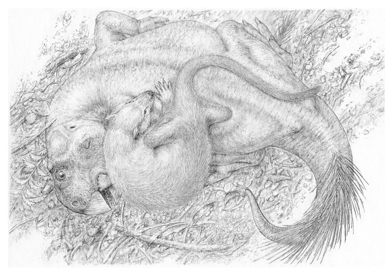
Figure 2. Life restoration showing Repenomamus robustus grappling with Psittacosaurus lujiatunensis . Artwork by Michael Skrepnick. Reproduced with permission.