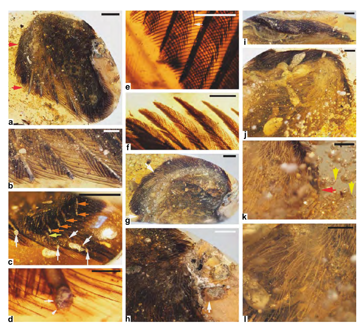
Figure 2 | DIP-V-15100 photomicrographs. (a) Overview of dorsal wing surface, with claws (red arrows), dorsal details in a-h. (b) Primary feathers and barbs truncated by amber surface. (c) Primaries (white arrows), secondaries (yellow arrows) and indeterminate feather (orange arrow), in basal zone of overlap (slightly oblique view). (d) Detail of primary rachis, with weak ventral ridge (inclined arrow) and barb ramus attachment somewhat low on side of rachis (horizontal arrow). (e) Primary feather microstructure and pigment distribution (t.l.), with hooklets on distal barbules (arrow). (f) Alula barbs with blunted apices and blade-like barbules with banded pigmentation. (g) Anterodorsal view highlighting alula separation from wing surface (arrows), as well as overall colour patterning (light hitting bubbles in amber creates a bright band paralleling edge of wing). (h) Bone and integument breaching amber surface, with well-preserved osteon complexes (circle of mottled bone at arrow), while most voids in bone and tissue have been permeated by milky amber, and skin is reduced to a translucent film not visible at this scale. (i) Extent of gas vacuoles and milky amber emanating from dorsal and ventral surfaces of wing, in anterior view. (j) Contrast between coverts and ventral coat of down and contours, with ventral details in j-l. (k) Current position of claw (red arrow) and claw marks within flow lines (yellow arrows). (l) Bases of down feathers attached to apterium with preserved skin texture and signs of saponification. Scale bars, 2.5 mm (a,c); 1 mm (b,h-l); 0.5 mm (d); 0.25 mm (e,f); 1.5 mm (g); t.l., transmitted light.

ventral tooth and the barbs taper to a less acute point apically (Fig. 2f). At least three rows of contour feathers are visible in the covert series, but coverage of the primary feather bases appears reduced, either as a result of weakly developed or pale major coverts, soft tissue covering the primaries, or taphonomy.